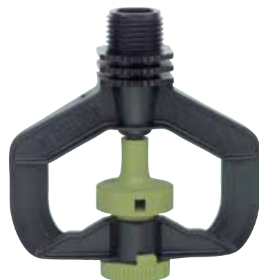
Inverted Rotor Max™